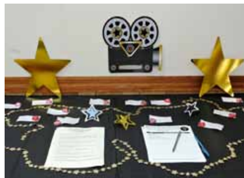
Everything was festively decorated for the occasion. This is the sign in table.