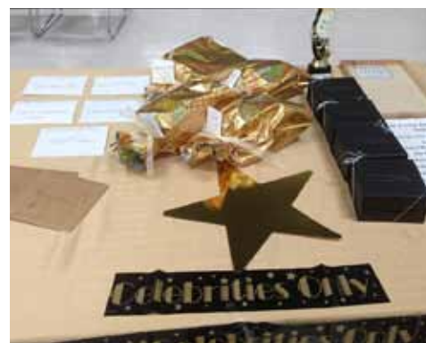
Awards, prizes and swag bags for the filmmakers.

Beginners: Come at 6:30 - bring your questions and get help.