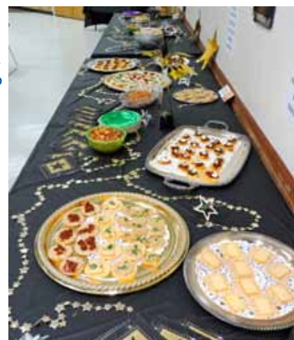
Great decorations and amazing treats!