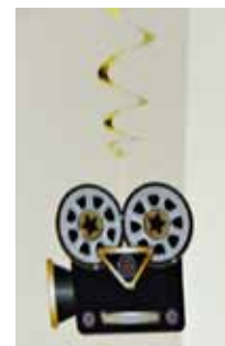
Decorations on the ceiling!