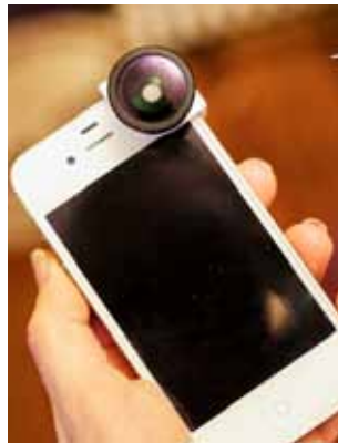
The olloclip is a quick-connect lens solution for the iPhone 4 that includes fish-eye, wide-angle and macro lenses all in one. Available from Amazon, around $60-$70.