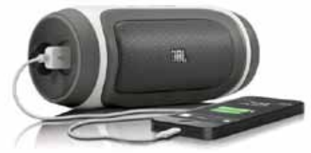
JBL Bluetooth speakers.