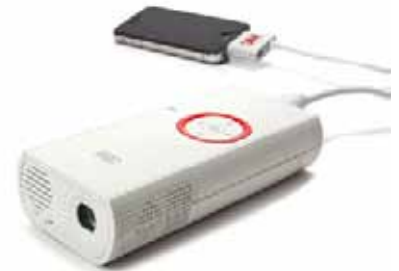
3M's MP225 pocket projector.