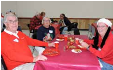
We had time to visit with friends, old and new.