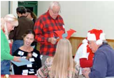
The questionnaire activity had everyone up, talking and mixing.