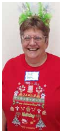
The shirt says "This is my UKMUG non-denominational Holiday Ugly Sweater."