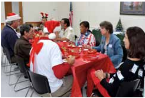
We enjoyed a family style meal. Everyone brought such yummy dishes to share!