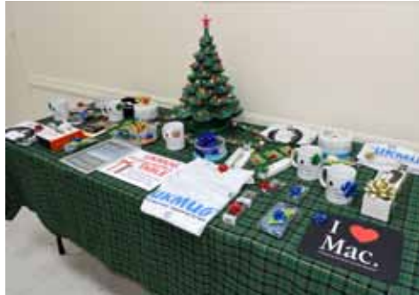
Under our tree were stocking stuffers from Santa, for everyone.