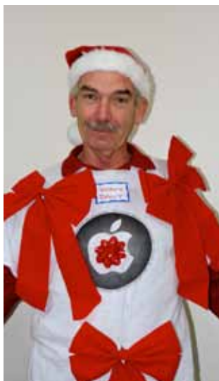
What can we say about Wavy Davy except that he sure went all out! That tee shirt needed some color, didn't it?