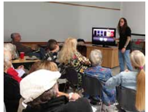
Jack kicks off the iParty with Apple TV.