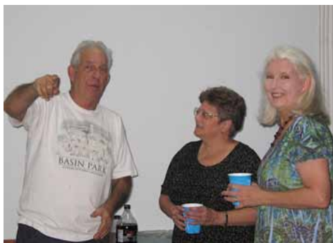
Always an interesting mix of people at our meetings!